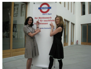
The two smokefree actresses from the German series "Gute Zeiten, schlechte Zeiten" are happy to promote the Smokefree Class Competition